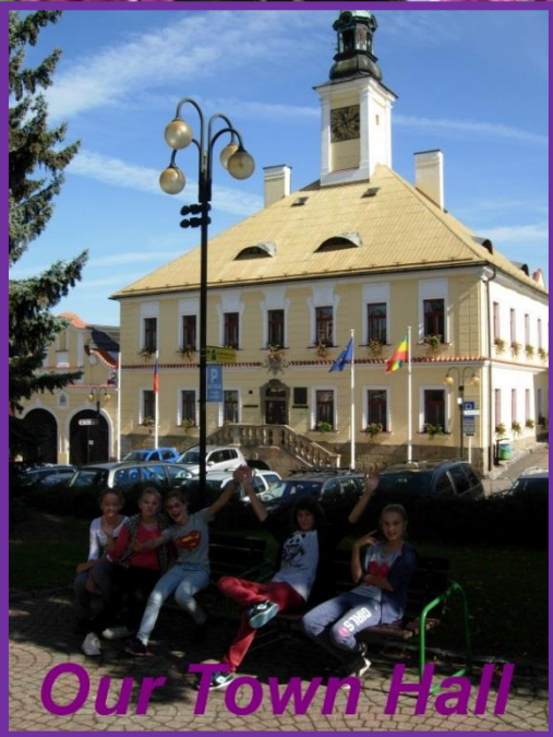
Our Town Hall