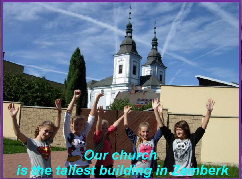
Our church is the tallest building in Zamberk