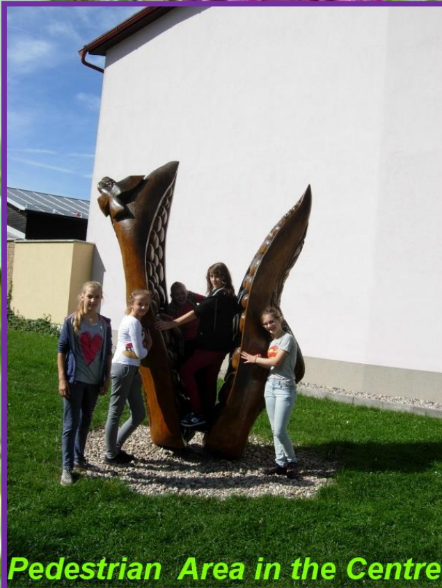
Pedestrian Area in the Centre