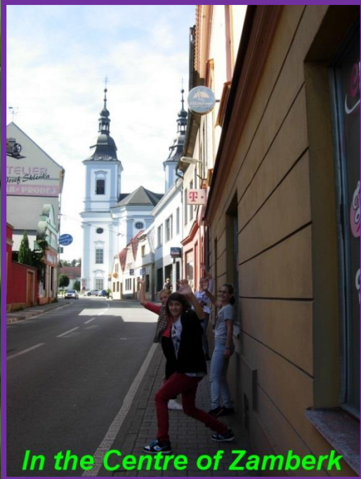
In the Centre of Zamberk