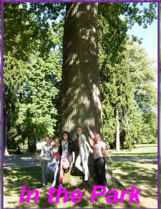
In the Park