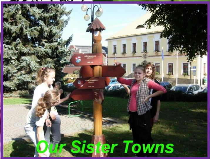
Our Sister Towns