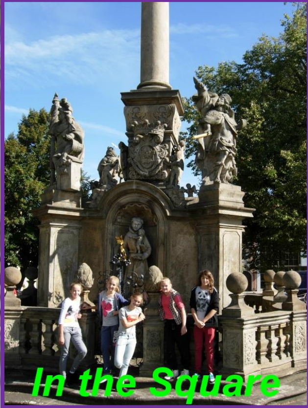
In the Square